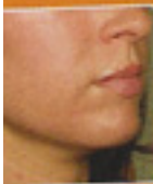
After 180 Days